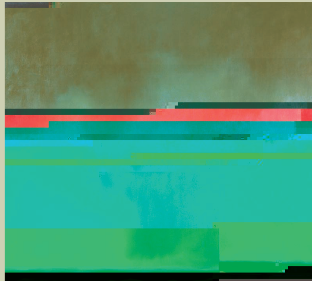
Darragh Hogan, Port Authority , 1998 Oil glazes on canvas, 81 1/8 x 93 1/8 in.

Conversations at Night: Barcelona II , 2000 C type print mounted on aluminum, 61 x 26 in.