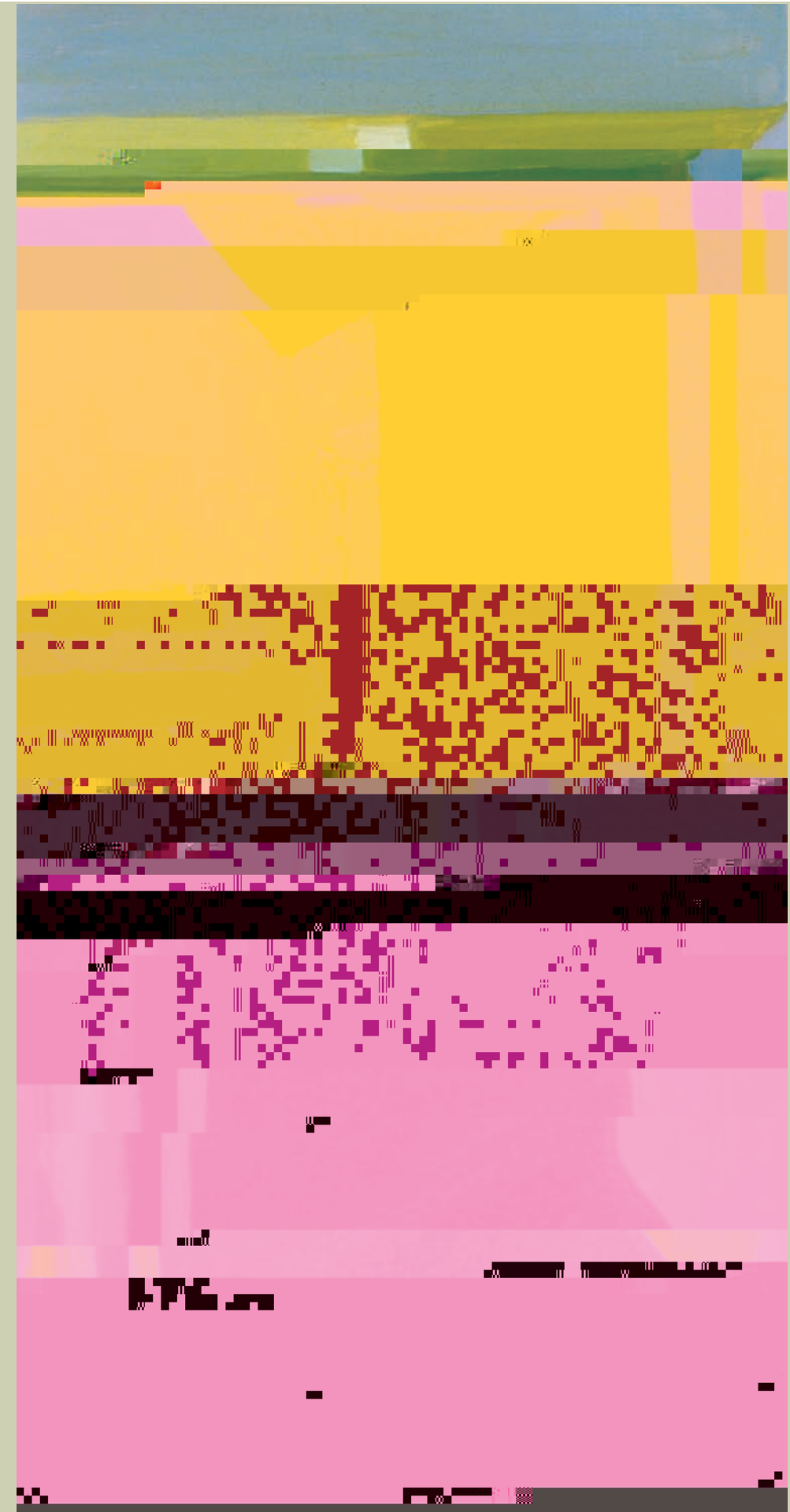
Elizabeth O'Reilly, Bedroom, Gola Island , 1999 Oil on board, 20 x 10 in.