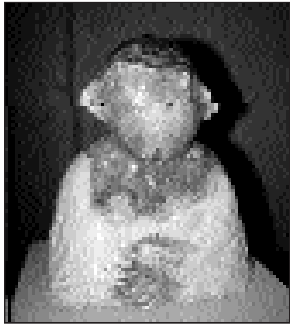
Leiko Ikemura OT (Weises Kleide) 1993