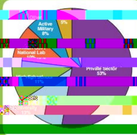
Initial Employment Sectors of Physics Bachelor's Classes of 2009 & 2010 Combined